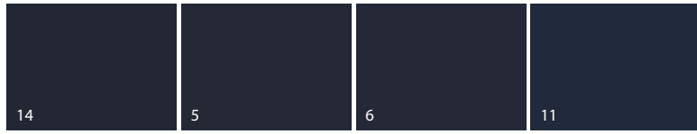
14 HEATHER NAVY 5 DARK NAVY 6 MIDNIGHT 11 NAVY