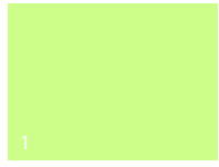
1 NEON GREEN